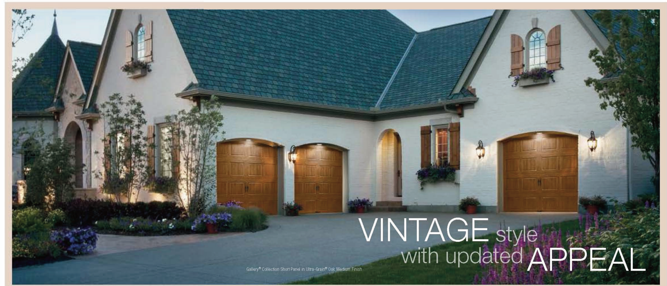
Gallery® Collection Short Panel in Ultra-Grain® Oak Medium Finish

Calculated door section R-value is in accordance with DASMA TDS-163.