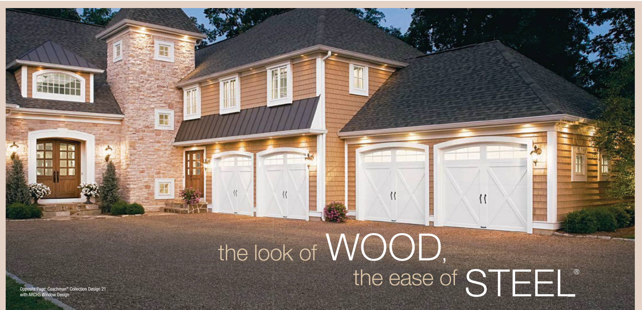
Opposite Page: Coachman ® Collection Design 21 with ARCH3 Window Design

Complete overlay and true arch window designs provide an authentic carriage house look setting Clopay's Coachman ® Collection above the rest.